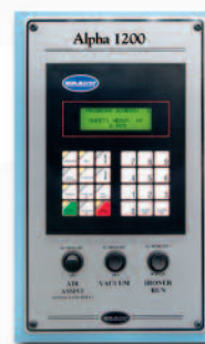
Spanish/English Bilingual Screen Displays