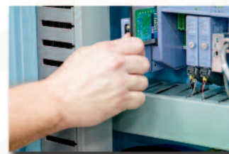
Flashcard for Easy Downloading of PLC Formulas